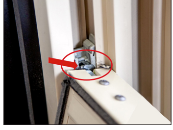
B Pivot Bars (located on the window sash)