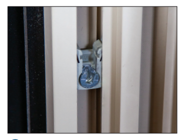
C Balancer (located in the window frame)

The steps below will guide you through removing your current double-hung window sash and installing your new window sash. Use the diagrams above to help locate each part required to complete your window sash replacement.