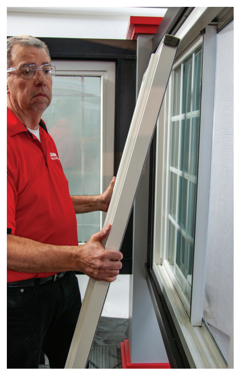
Step 3 You can now pull the sash out of the top track and remove it from the window.

Holding both sides of the sash, push it up into the top track so the bottom of the sash can be lifted out of the bottom track and swung in toward you.